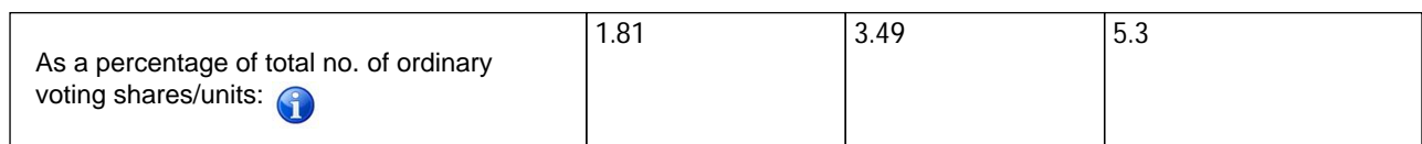
Table 3. Change in respect of rights/options/warrants over shares/units of Listed Issuer