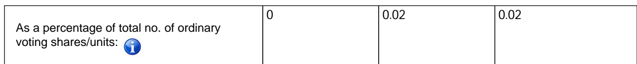
Table 3. Change in respect of rights/options/warrants over shares/units of Listed Issuer